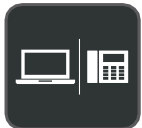
Multiple Devices Connection