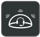
Acoustic Shield Technology

The Yealink WH62 is a new entry-level DECT wireless headset, with WH62 Dual and WH62 Mono two models. Work seamlessly with major UC platforms and integrate natively with Yealink IP phones. Yealink Full-band Audio Technology and Acoustic Shield Technology make you talk and hear clearly during phone calls and enjoy the stereo crystal music experience. With easily on-ear control, interruption free, comfortable wearing, WH62 is a nice partner either for communicating or collaborating.