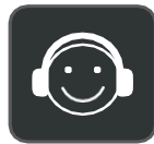
All Day Wearing Comfort