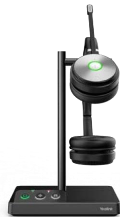
WH62 Dual Teams WH62 Dual UC

Based on hundreds of headform evaluations and thousands of wearing comfort tests, WH62 well meets the ergonomic requirements. Besides, with premier soft leather cushions and lightweight design, you can wear it all day comfortably. For more workspace freedom, WH62 can also free you up to 160m away from the desk.