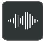
Optima Audio Experience