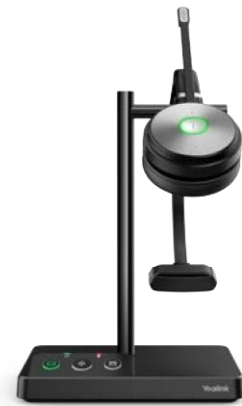
WH62 Mono Teams WH62 Mono UC